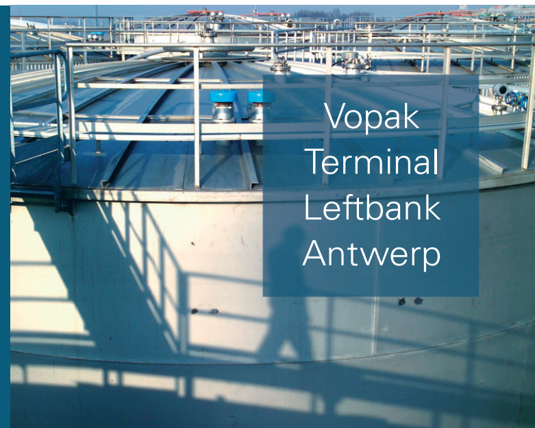
Vopak Terminal Leftbank Antwerp

Vopak stores and handles a large variety of products for companies operating in the chemical and oil industries worldwide. With over 73 strategically located terminals in 29 countries on 5 continents, Vopak offers a truly global network.